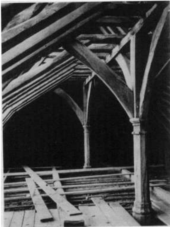
Kingposts in roof.

The nave roof is heavily framed with four tie beams across the nave each