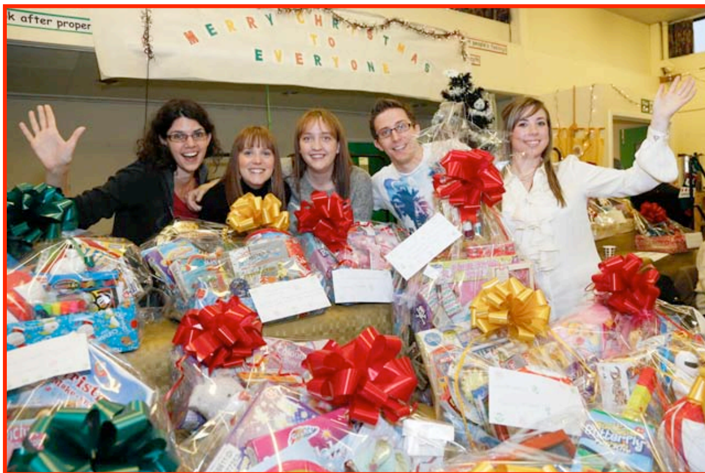
Shorne School teachers with some of the produce to be sold at the Christmas Bazaar organised by FOSS

FOSS would like to thank everybody in the parish for all their continued help and support. We could not achieve what we do without your enthusiasm.