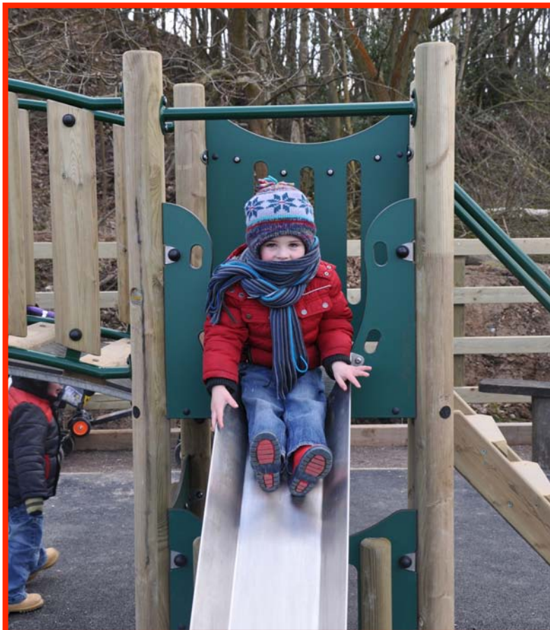
Just two of the various activities being enjoyed by youngsters in the Country Park's new toddler play area