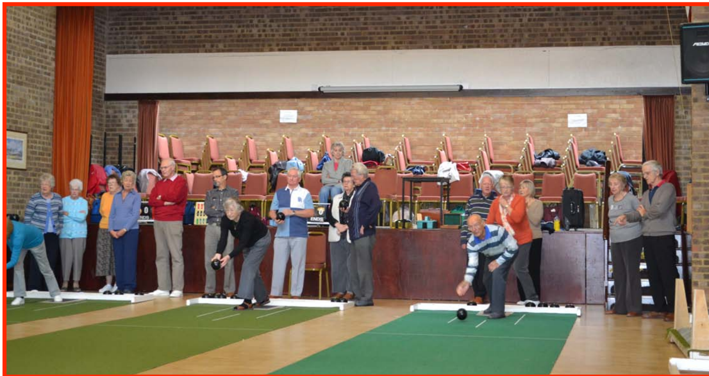
Short Mat Bowls members in action at one of their busy weekly sessions

Once again our activities throughout 2012 included a spring lunch, our trophy presentation dinner in October and friendly matches held twice yearly with Cobham Golf Club. Our usual pre-Christmas gathering including partners was also enjoyed by all.