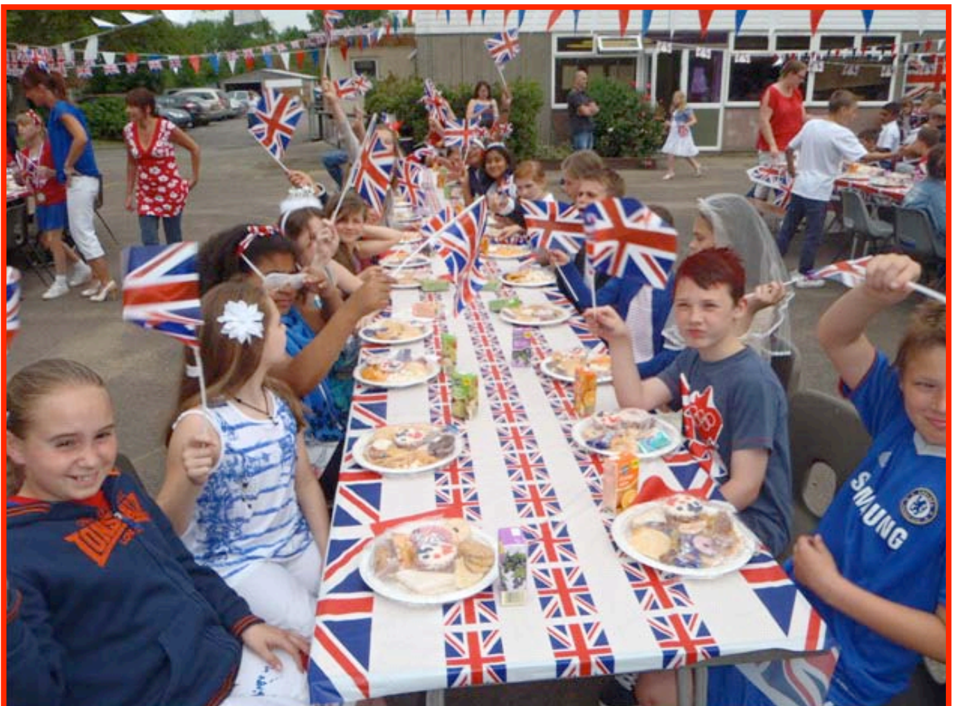
Shorne Primary School children enjoying the Diamond Jubilee celebrations at their street party