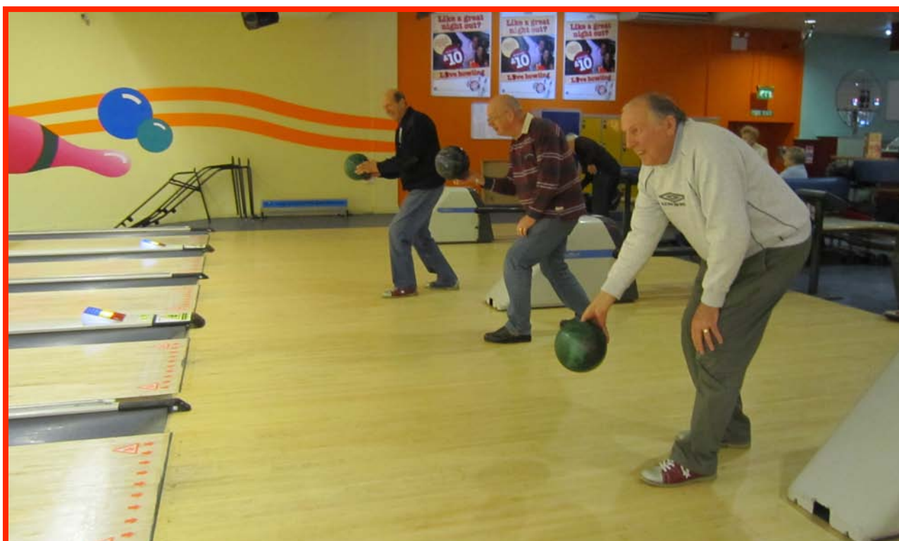
ShornAra members enjoying their fortnightly ten pin bowling session at the AMF Bowling Centre, Gravesend

So, all in all, another very successful year for ShornAra.