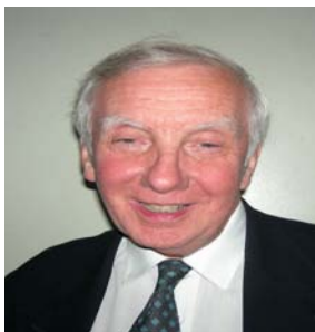
Chairman Shorne Parish Council Planning and Highways Committee