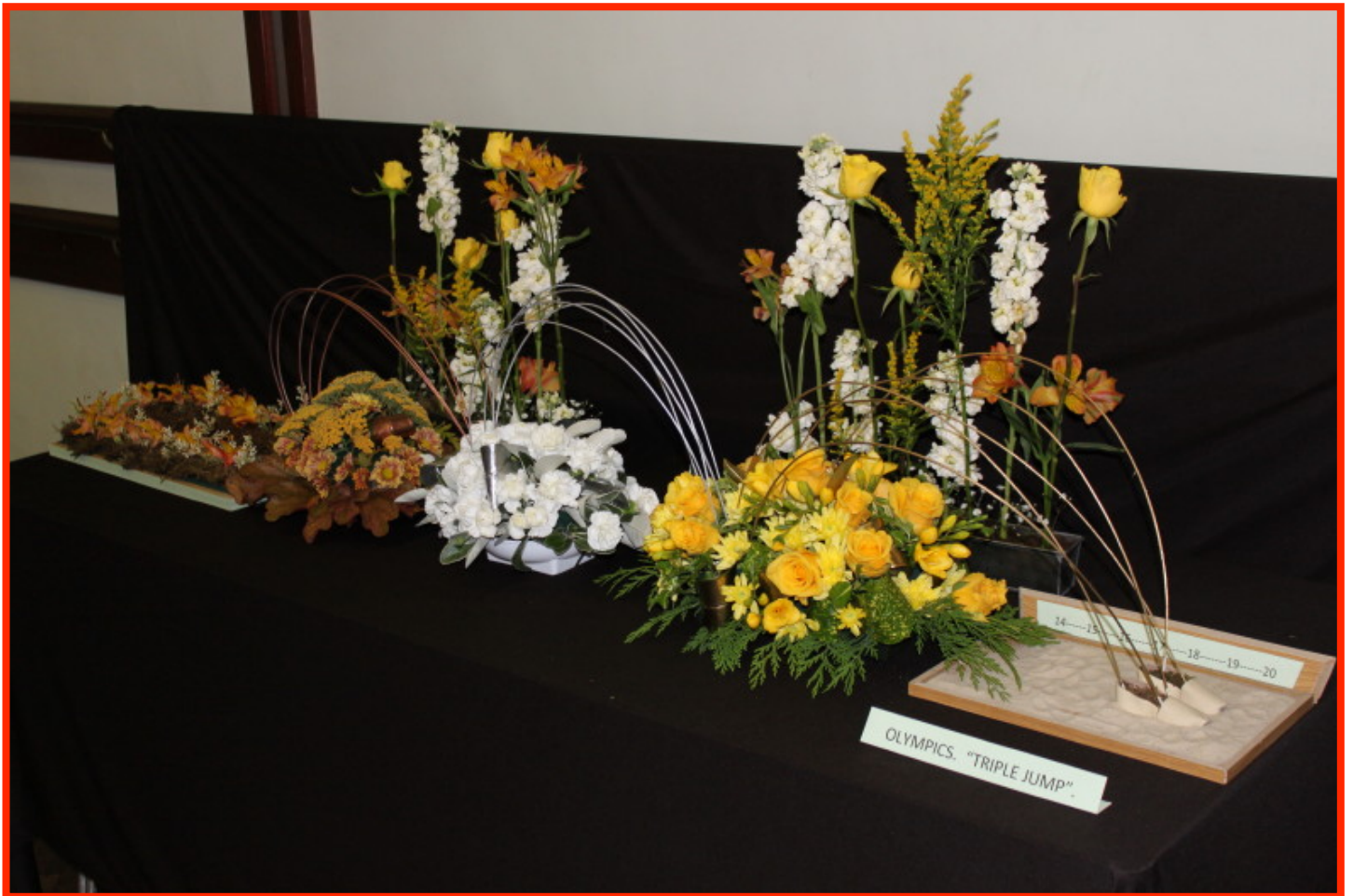
Shorne Flower Arrangers' depiction of one of Olympic Games premier athletics events

We are looking forward to another successful year in 2013.